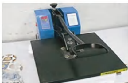
4. Press the handle down for 10 seconds