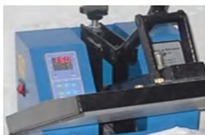
1. Set the temperature of the heat Press