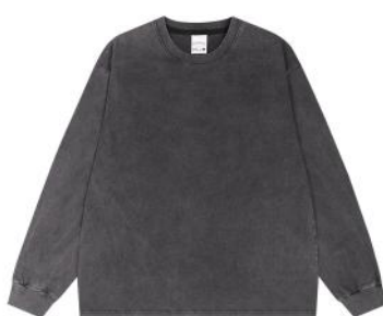
Wash water black