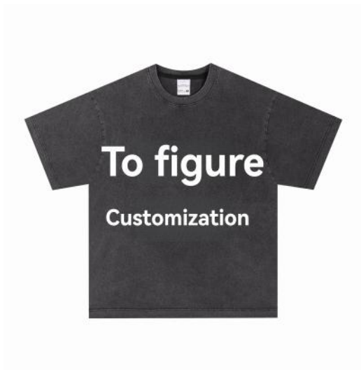
Wash Water Black