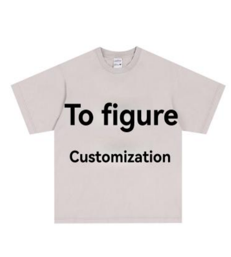
Wash Water Gray