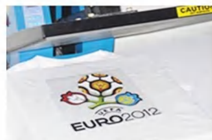
3. Place heat transfer pattern up