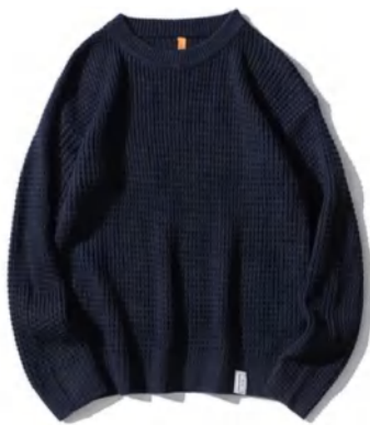
-文青色- Navy blue