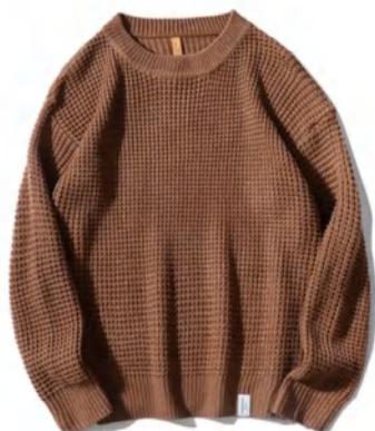
-黄咖色- Coffee color