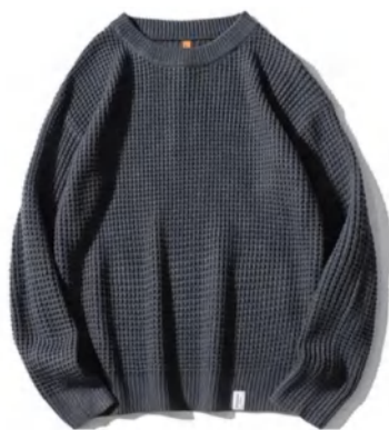
-深中灰- Deep gray