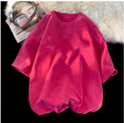
Washed Rose Red