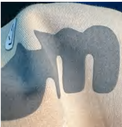
Flock Print Logo